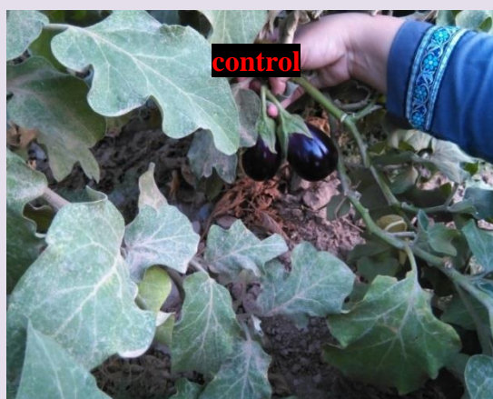
The effects of tabak 15-5-30 & 10-52-10 on eggplant - Isfahan - Aran & Bidgol - 2015