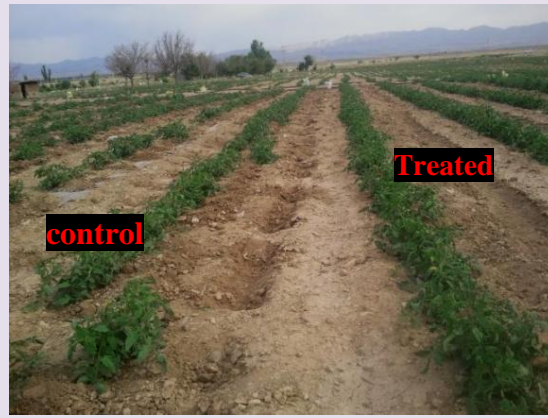
The effects of Algora & Diport on tomato - Ghazvin – Takestan - 2015