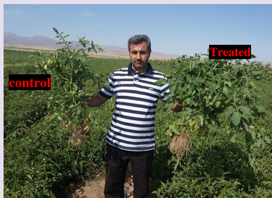
The effects of Zinc seed treatment Aria & Hasmic on tomato – Khorasan -e Razavi- Torbate jam -- 2015