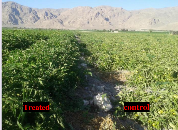
The effects of Bostano & Algora & Waker mix on tomato – Fars - Marvdasht - 2015