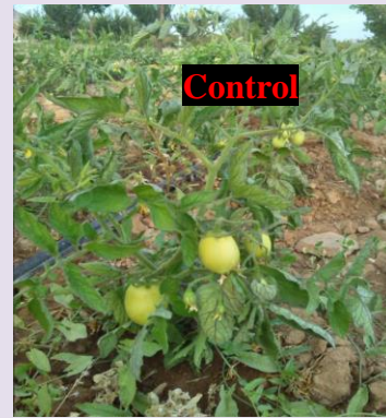
The effects of 10-52-10 Aria on tomato – Chaharmahal and Bakhtiari – Borujen - 2015