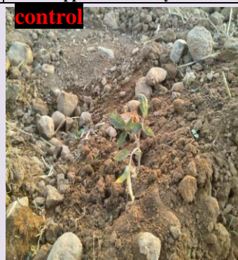
The effects of 10-52-10 Aria on tomato – Chaharmahal and Bakhtiari – Borujen - 2015