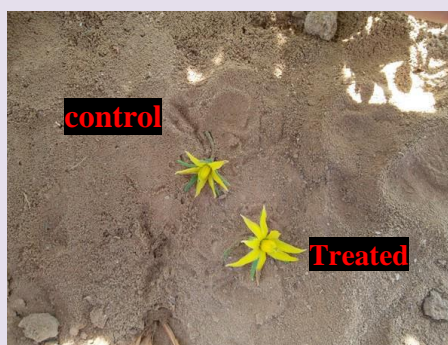
The effects of Waker Mn on tomato - Khuzestan – Shushtar - 2015