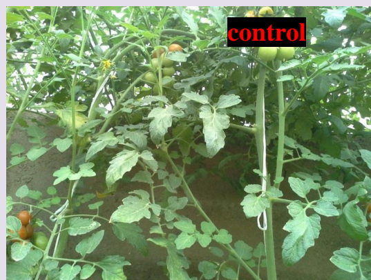
The effects of Waker mix & Algora on tomato - Kerman - Jiroft- 2015