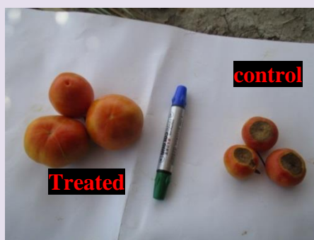
The effects of Waker Ca on tomato – Khuzestan – Ramhormoz - 2015