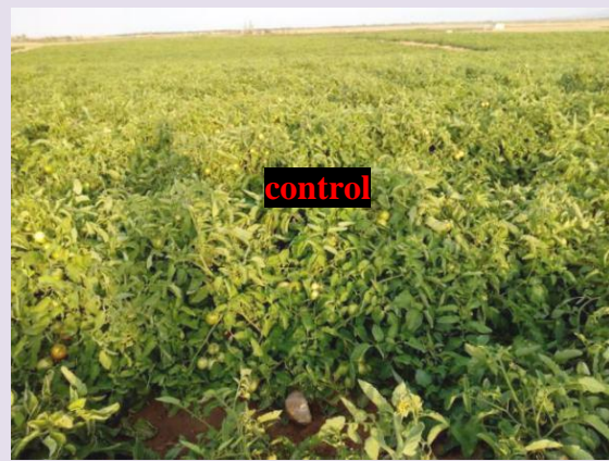
The effects of Algora & Setak on tomato - Ghazvin – Takestan - 2015