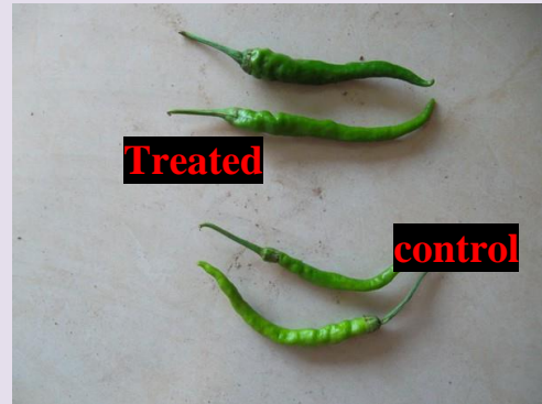
The effects of Tabak 19-19-19 on peper - Khuzestan - Gotvand - 2014