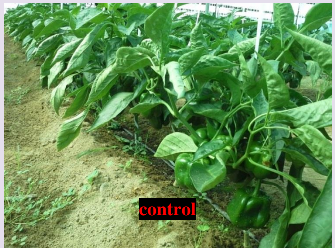
The effects of Algora & Waker mix on Bell peper- Kerman - 2014