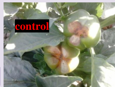
The effects of Waker Ca on peper - Alborz - Tonkaman - 2015