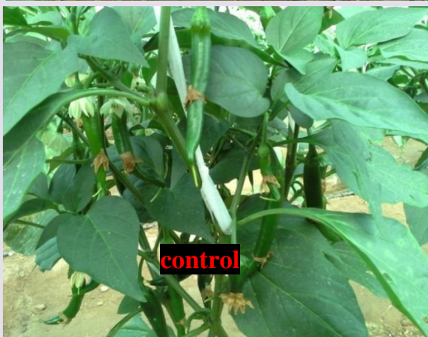
The effects of Algora & Waker mix on peper- Kerman- 2014